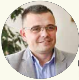
BRANISLAV NEDIMOVIĆ Minister of Agriculture and Environmental Protection

There are at least three answers to the question of why joining NALED was useful for my local government. The first is that we became a better service to citizens and businesses. We also received international recognition from the Financial Times, which would not have happened if it weren't for NALED. Third, at least one investor who created 700 jobs came to Sremska Mitrovica thanks to the activities of NALED. That's why I can tell all my colleagues that there are always at least three good reasons why they should be part of NALED.