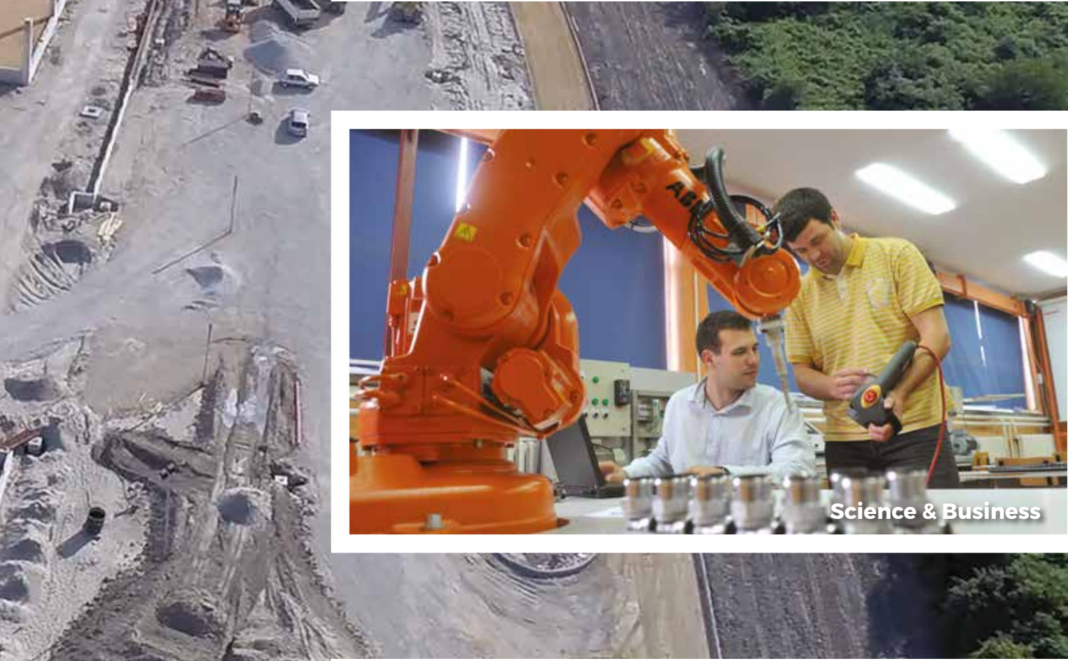
Science & Business