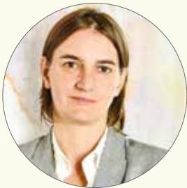
ANA BRNABIĆ Minister of State Administration and Local Self-Government

I know what great responsibility lies with those of us who came from NALED to the Government of the Republic of Serbia, because I know how much is expected of us, and I also know that NALED will be our biggest critic. That's what I expect from NALED, just as I expect concrete suggestions for solutions.